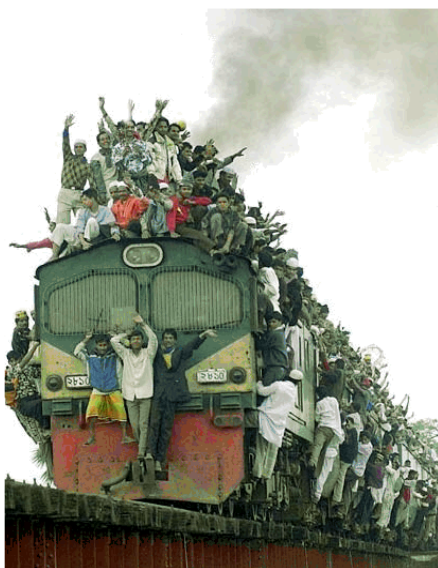
...and then RIGHT BELOW: ...the Hawks Bandwagon after Round 7 in 2009!